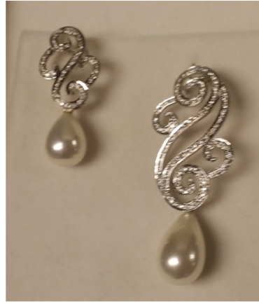
Diamond and pearl earrings and pendant