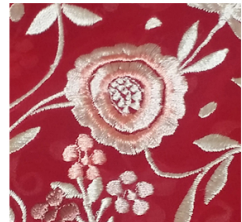
Red embroidered gara pullav