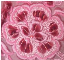
Pink sequenced and embroidered saree

$5.00 for 1 ticket | $15.00 for 4 tickets | $30.00 for 10 tickets