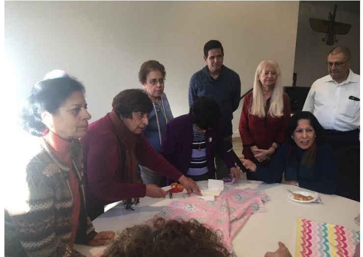
Making blankets for the Linus project