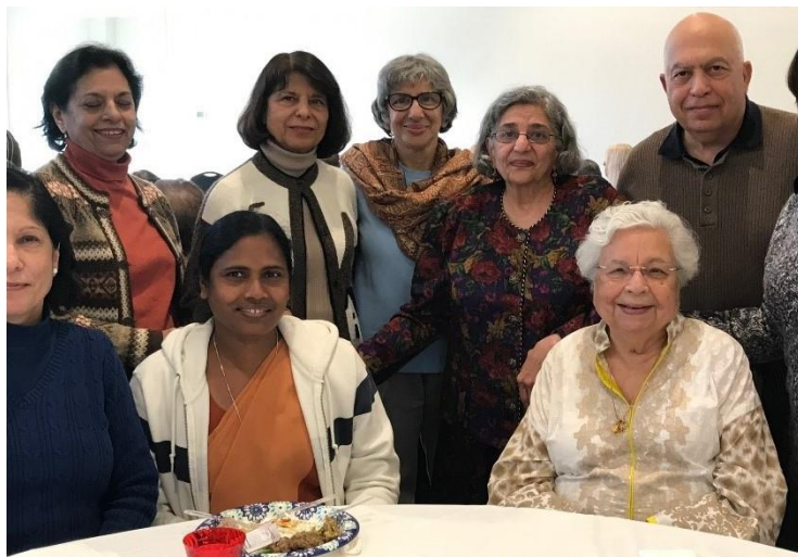
Z-Goldies Thanksgiving function

The Z Goldie's Happy Thanksgiving Function at the Darbe Mehr on Saturday, November 11th was a roaring success judging from all the various activities that took place that day. We had an appreciative and enthusiastic crowd of over 50 attendees most of them being....you guessed it, Zarathushti Goldies!