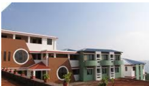
Bel-Air Hospital, Panchgani