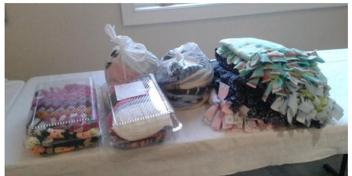
Blankets and knitted hats donated to the Brooklyn Church and "Lifting up Westchester"

On that day, we also collected a sizeable number of toiletries and canned goods which were donated to the "People to