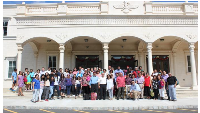
ZAGBA and ZAPANJ members arrive at the Dr-E-Mehr

Following the outside prayers, there were indoor prayers inside the Kebla prayer room. Children and young people were invited to sit within the prayer room, while adults watched from just beyond the Kebla, through the glass wall to view the Boi ceremony. The Atash Niayesh and Tandorosti prayers were performed by Ervads Dadina and Panthanki.